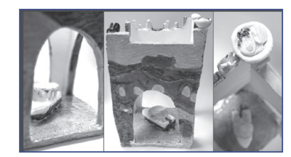
Dylan Devine, Gr. 12